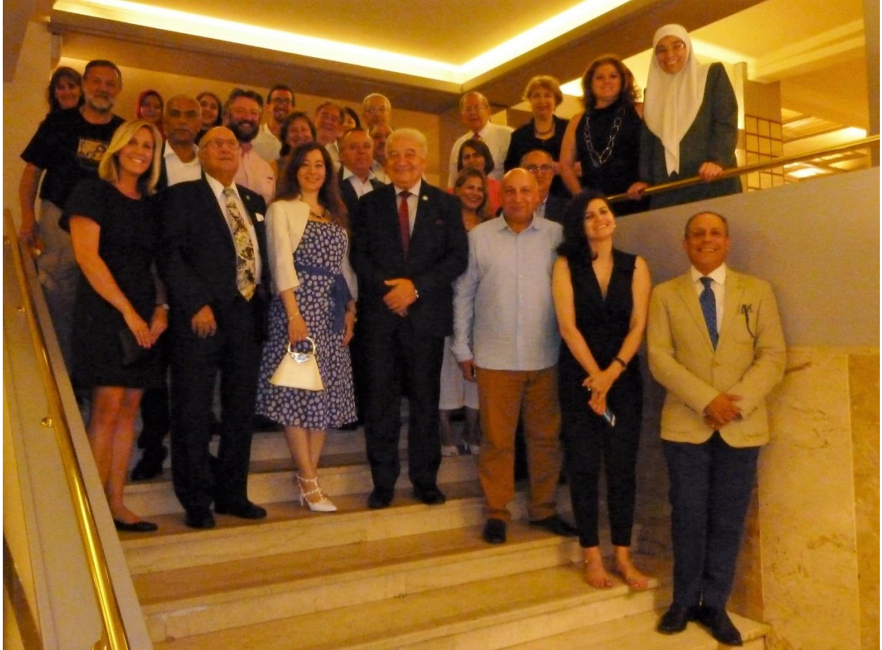
On Tuesday evening the Gala Dinner held at the Florence Hill where 50 participants were present. See the group photograph below