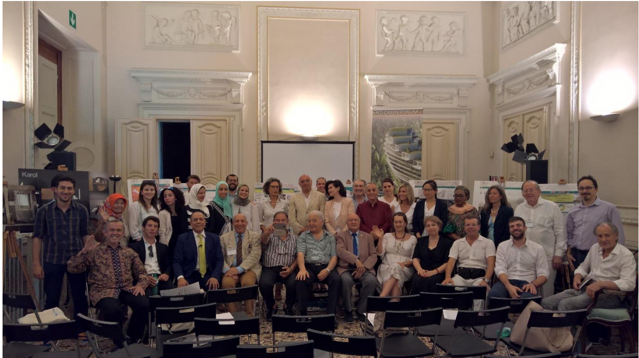
A group photograph was taken inside Vila Strozza: