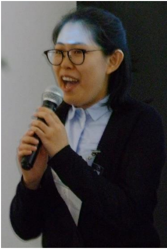
Chinese presenter – China